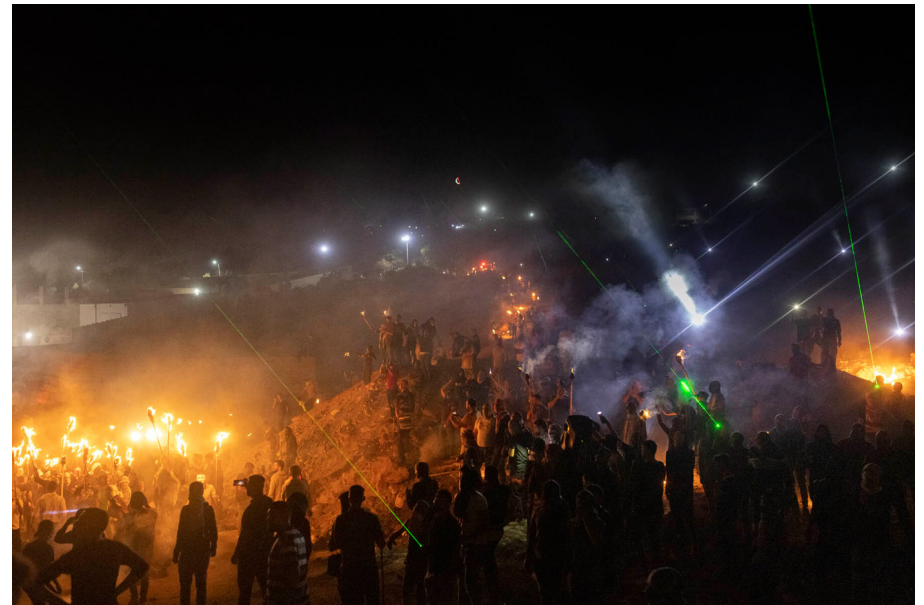
Protesters in Beita employing the "night confusion" tactic to harass settlers, flashing high-power laser pointers and lights at the settlement, marching on it with burning torches, and directing the smoke of burning tires at it.

limited, as postal stamps are in short supply. As always when writing to prisoners, it's important to remember that all correspondence is monitored.