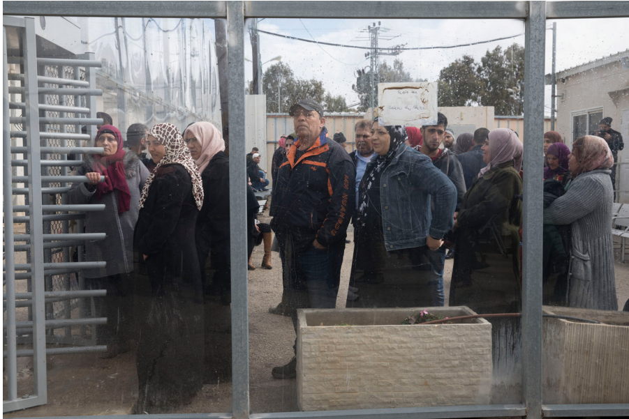
Families of Palestinian detainees waiting to be let into the Ofer Military Court near Ramallah.

To back up a bit—Jonathan, you’re in the middle of a court case at the hands of the Israeli government, accused of throwing rocks during a protest in the West Bank. Can you explain the context in which you were arrested?