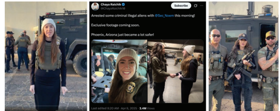
Noem showing off her gun expertise.

described the men detained as gang members "with long rap sheets." Noem called them "dirtbags" and accused them of human and drug trafficking. None of the three men arrested were charged with the crimes Noem accused them of, two had no previous criminal history.